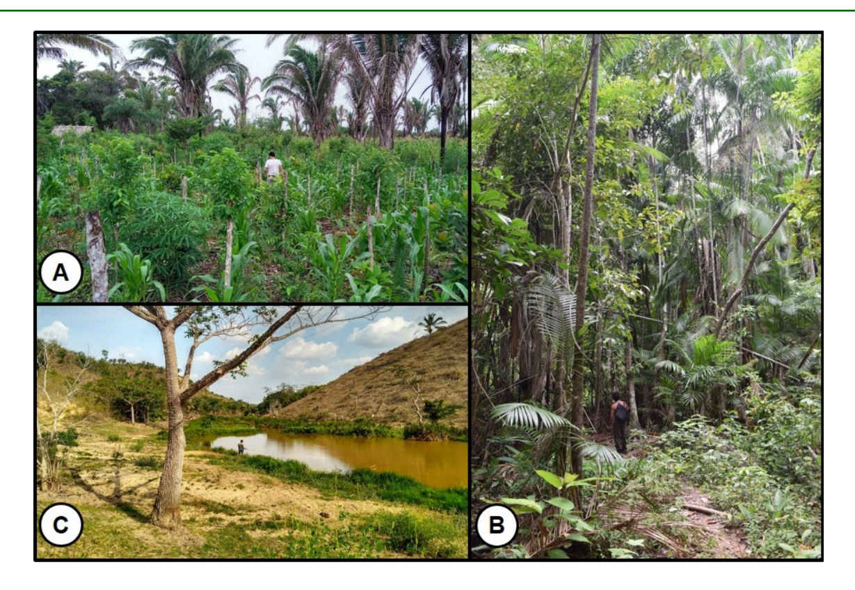
Figura 2. Landscapes of the studied areas in the Amazon region of Maranhão state, Brazil: (A) Slash-andmulch field in Agrovilas of Alcântara, (B) Old Forest in Aldeia Awa; and (C) Lagoa degraded area in Vila Bom Jesus.

ves, while in Aldeia Awa all Portuguese-speaking indigenous persons (n=7) participated in the survey. Interviews were conducted to ascertain the population's perception of environmental changes, the associated causes and the importance of conserved areas (How and why has the forest changed? Have the period and amount of rain remained the same? and the river? What do you think is causing these changes?). In Alcântara and Vila Bom Jesus, these questions were answered through semi-structured interviews (Albuquerque et al. 2014). With the Awa Guajá, these topics were addressed in informal interviews, usually in a participatory meeting, given that most of them speak only the Guajá language and only a few men use Portuguese in public (Berto et al. 2019). Thus, the Awa Guajá who spoke Portuguese performed the translation during the dialogues.