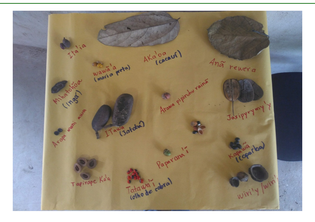
Figura 3. Parts of plants collected during guided walks, with subsequent identification, in Aldeia Awa, Maranhão state, Brazil.

ate the conserved forest areas with ensuring the provision of water, wood and charcoal, and with hunting (60%), as well as recognizing the contributions of forests to the formation of soils for future fields (40%), and the rainfall regime (6.6%).